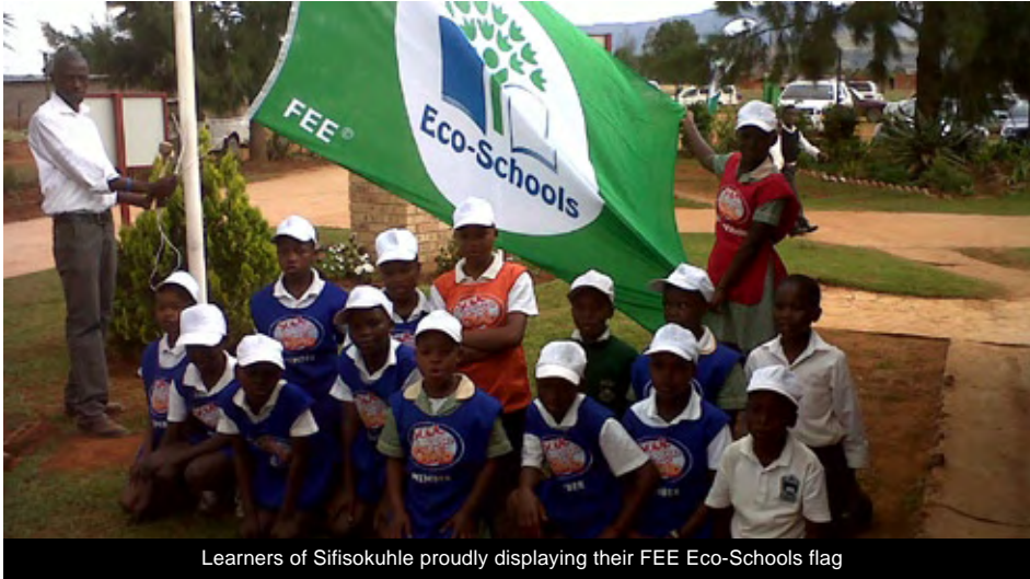
Learners of Sifisokuhle proudly displaying their FEE Eco-Schools flag