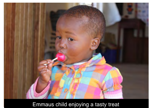
Emmaus child enjoying a tasty treat