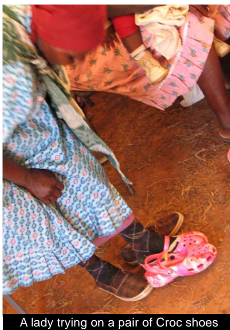
A lady trying on a pair of Croc shoes

A substantial donation of Croc shoes, as well as some blankets, were distributed amongst the adults.