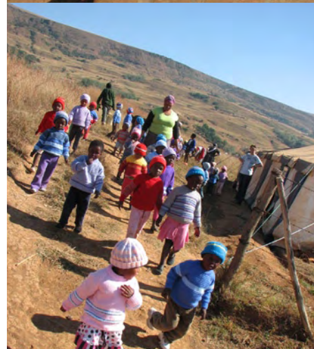
Children at the play-centre