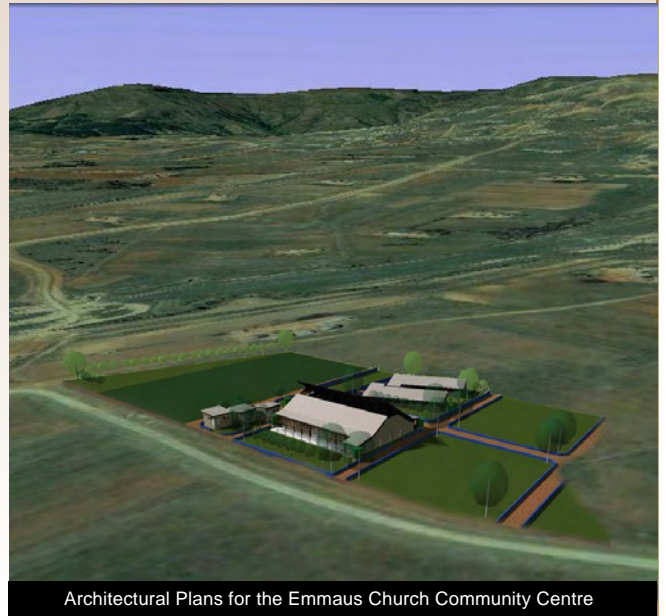
Architectural Plans for the Emmaus Church Community Centre