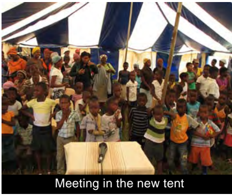
Meeting in the new tent