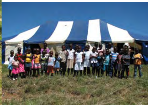
Emmaus children outside the tent

During the trip we were also able to deliver, and set up, a 250-seater tent, kindly donated by the Northcliff Union Church