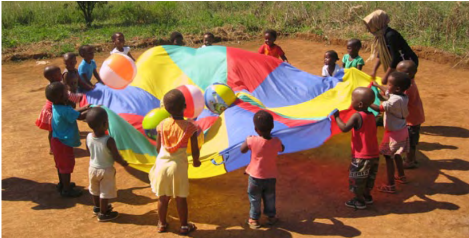
The nursery school children loved playing with the balls and 'parachute'