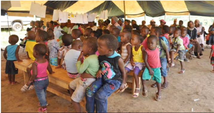
Children sang songs and the Lords Prayer to greet the American visitors from WAAP