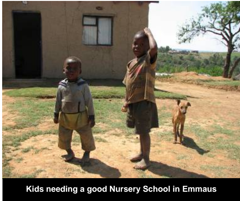
Kids needing a good Nursery School in Emmaus

Don and Cheryl travelled down for the day to do this presentation and it seemed to go very well. We are awaiting further input and feedback from the Okhahlamba municipality but from all appearances at the meeting it seems very promising. Please pray with us that God will continue to open doors as He sees fit. We need teams to come help us build and do outreach in the area – particularly amongst the children and in the schools.